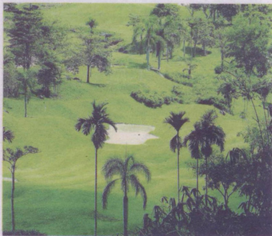
Rolling hills: The narrow undulating fairways are a distinctive feature at Berjaya Hills Golf and Country Club.

Two holes later on No. 4, golfers find the most difficult challenge at Berjaya Hills. This 396m par-4 gives nothing away and demands total focus. Anything less than precision is punished wholesale. A huge valley runs across this harsh dogleg and