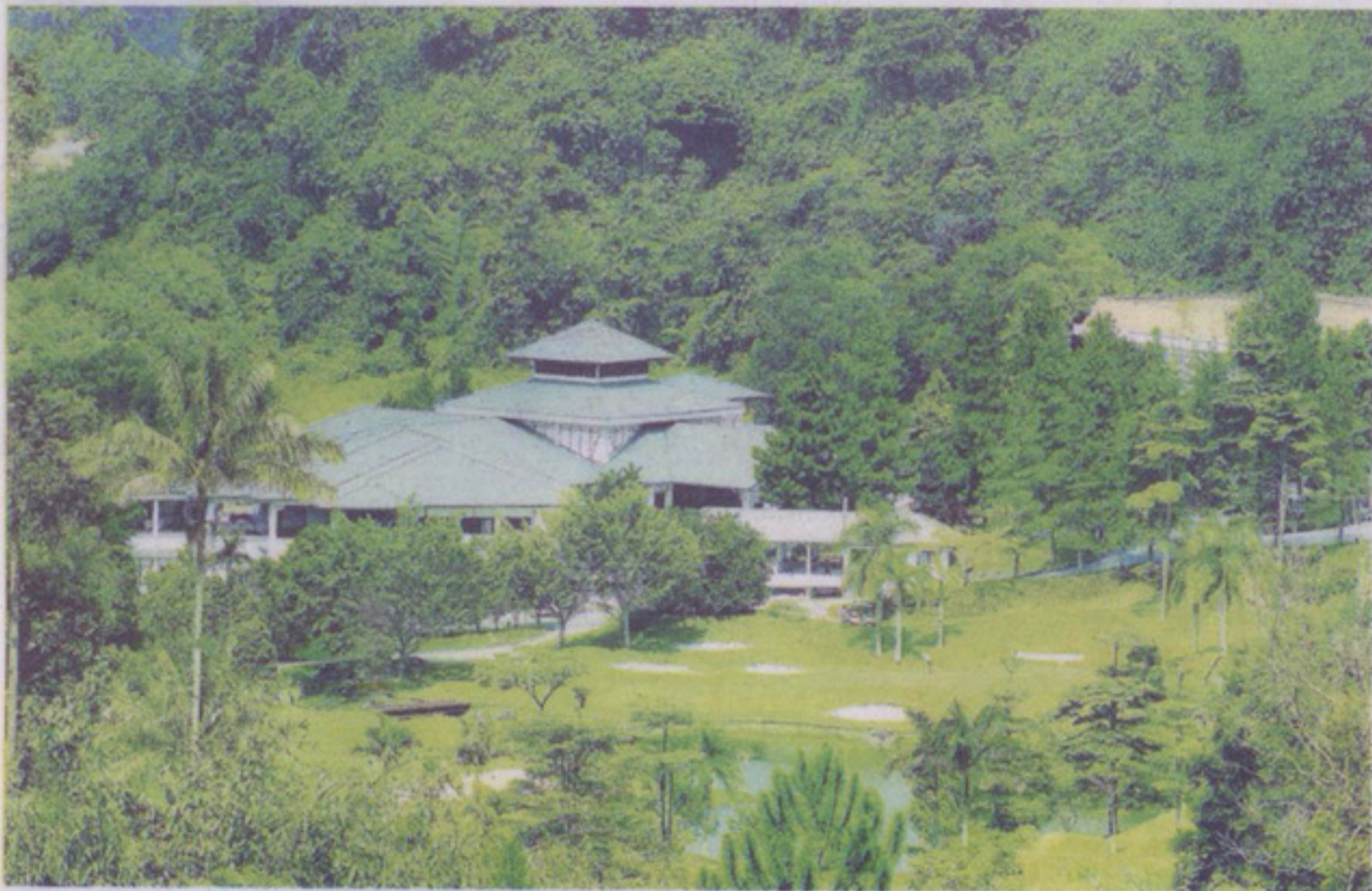
Tricky: The Par 5, hole no 18 at Berjaya Hills can lead to birdies as well as bogeys.

J UST 45 minutes from Kuala Lumpur is the perfect highland golf getaway - the Berjaya Hills Golf and Country Club.